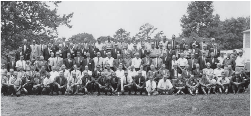
Electric Utility Fleet Managers Conference, 1954